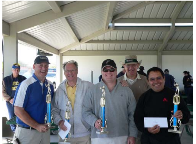
The 2009 Golf Tournament Champions T-Bone and Eggs